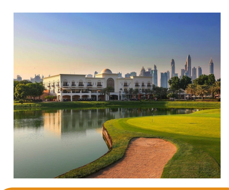
The Montgomerie Golf Club