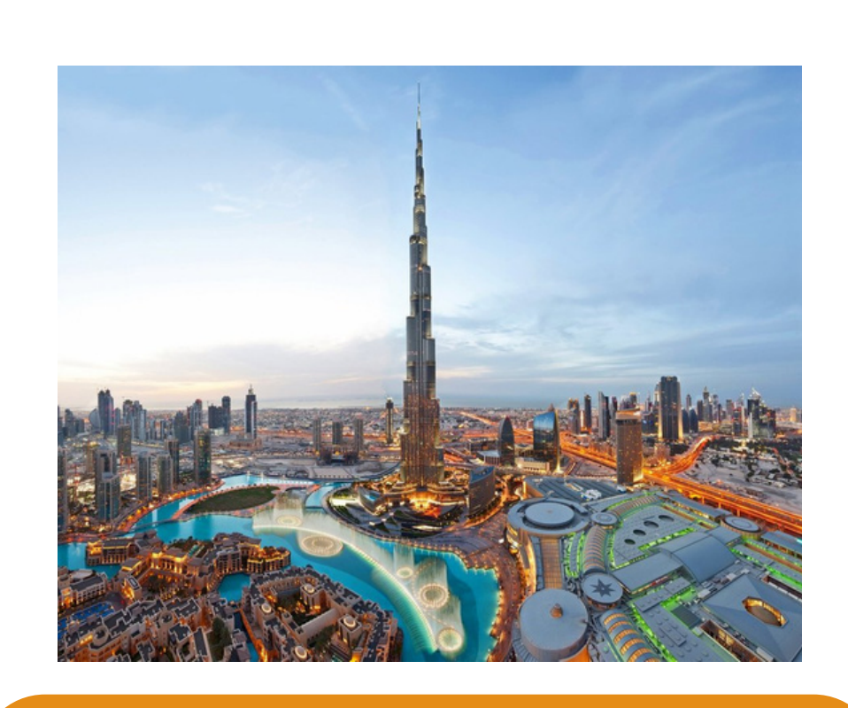
Dubai City Tour