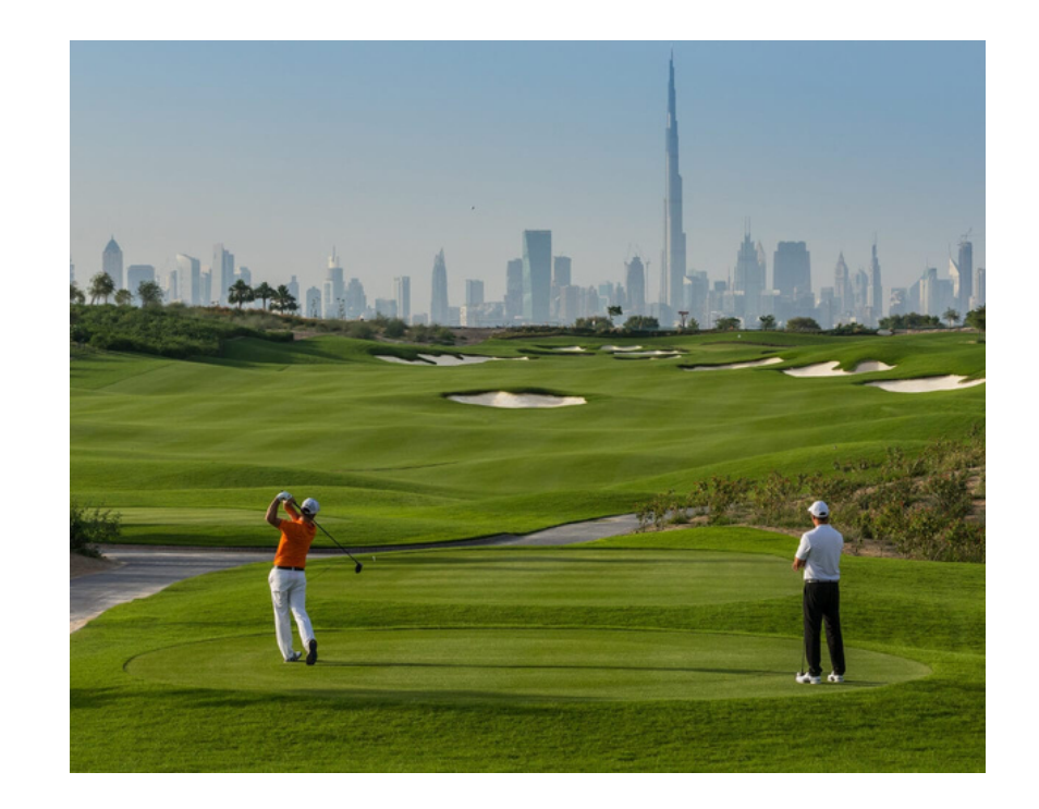
Dubai Hills Golf Club